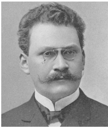
Space and Time: 1908 - 2018

Organized by the Minkowski Institute (Montreal) and the International Society for the Advanced Study of Spacetime